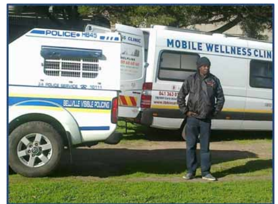
Police interrupt service delivery while a staff member waits.

Frustration. Officers consistently described themselves as frustrated by their own organisational structure and by the lack of understanding of the limited role that law enforcement does and should be playing in regard to drug use issues.