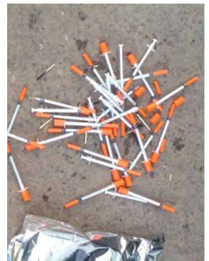
Used syringes are returned & counted.

11. Set up controlled spaces for injecting drug use. Explore what a safe injecting facility would look like in the eThekweni environment and establish a facility where PWID could inject with the required resources on hand.